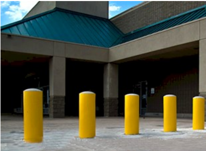
Model B-36F Bollard System

* Must be installed in groups of three to maintain engineered crash rating.