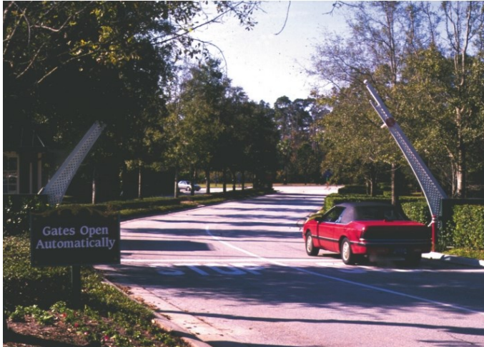
Model VP2 with Custom Gate Panel

* Operating time depends on gate length. ** Custom arm lengths available.