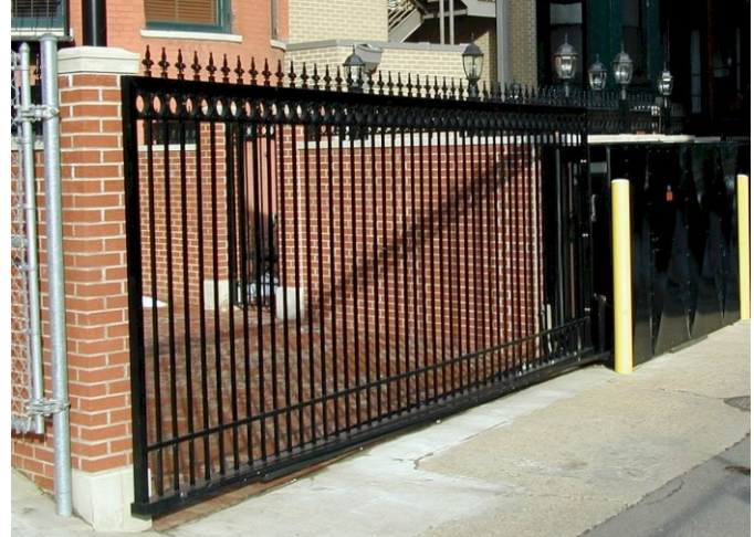
Model VP with Ornamental Gate Panel